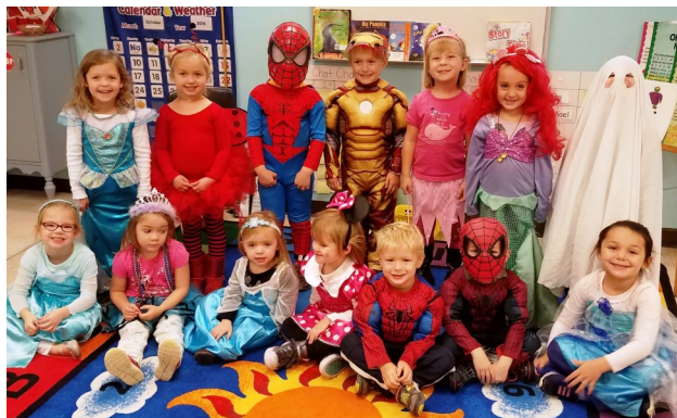
The preschool class in their Halloween costumes.

Reminder!: The Center is closed on Thursday and Friday, November 24 and 25 for Thanksgiving.